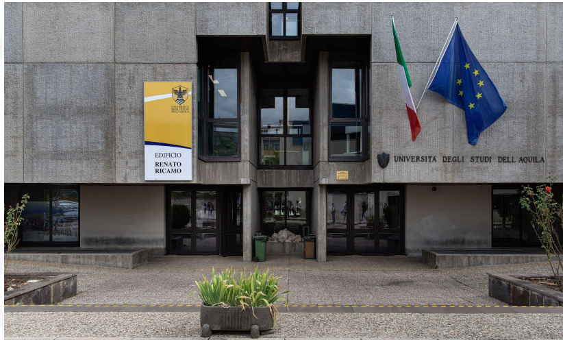
Biotechnological and Applied Clinical Sciences