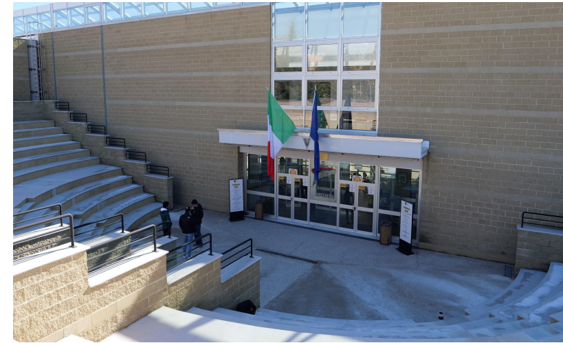
Industrial and Information Engineering and Economics