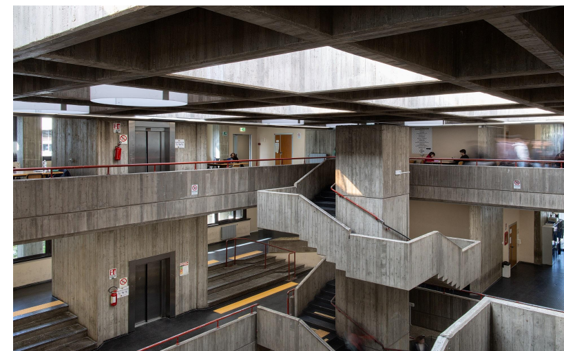
Physical and Chemical Sciences