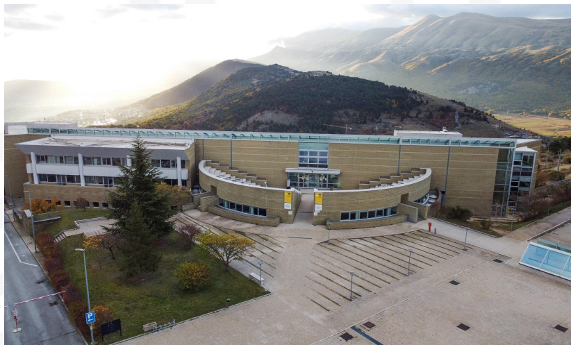
Civil, Construction-Architectural and Environmental Engineering