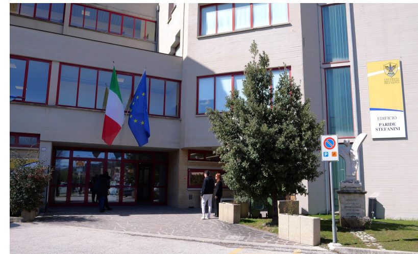
Life, Health and Environmental Sciences